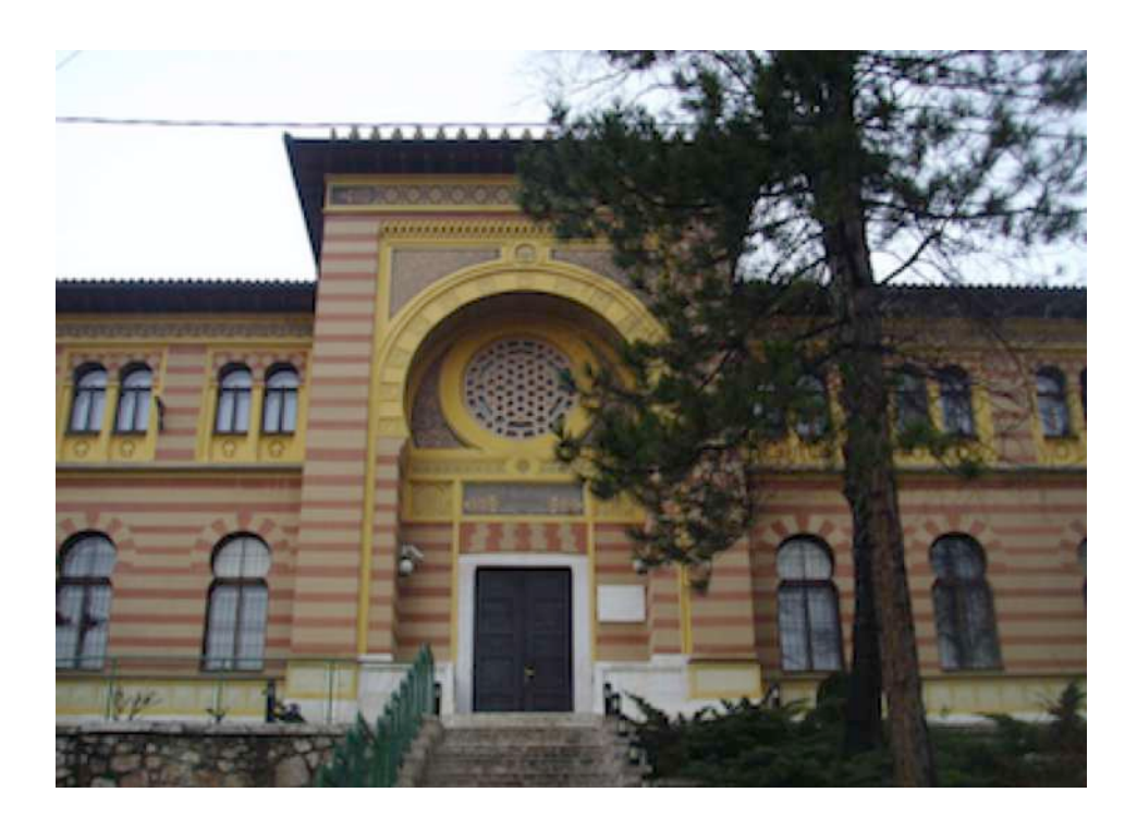
University of Sarajevo - Faculty of Islamic Studies

The working language of the Summer School will be English.